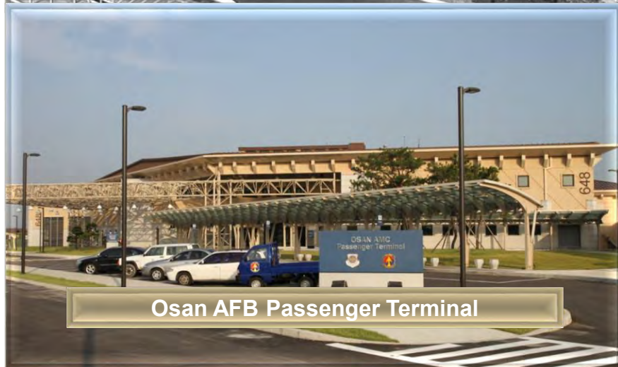
Osan AFB Passenger Terminal