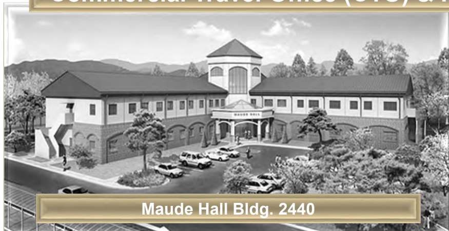
Maude Hall Bldg. 2440