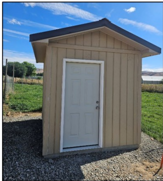
Exterior of a single-family POET system

SINCE THE START OF THE POET PROGRAM, THE ARMY HAS PRIORITIZED ACTION TO QUICKLY DELIVER INTERIM SOLUTIONS TO THE COMMUNITY OF EAST SELAH.