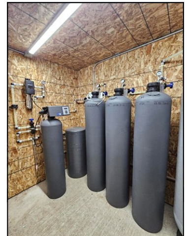
Some components in a single-family POET system.