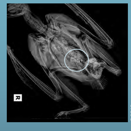
This X-ray shows a bald eagle with lead fragments in its stomach.