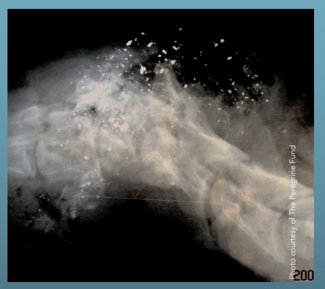
This x-ray shows the many fragments left behind in a mule deer neck shot with a lead bullet.