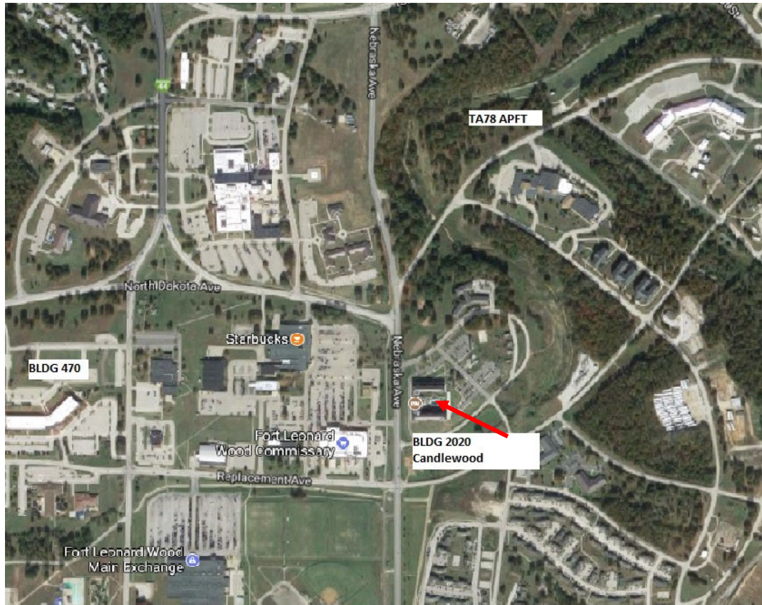
Fort Leonard Wood Cantonment Facilities