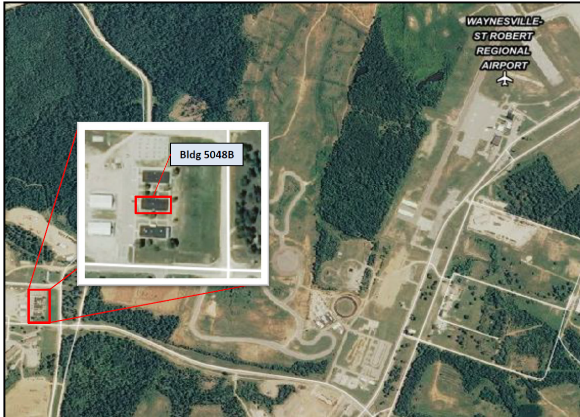
TA244 Classroom Location

Proceed on Iowa Ave from main post cantonment area. Go past the Waynesville-St Robert Airport and turn right on to Winchester Rd/FLW 28. The turn is marked by a Brown sign that reads TA244, Prime Power School. Drive approximately 3/4 of a mile and enter the TA 244 training area. You will pass through an unmanned, large steel gate. Take the first right into the parking lot. There are three identical buildings in a row, 5047-5049. Your classroom is will be in building 5048.