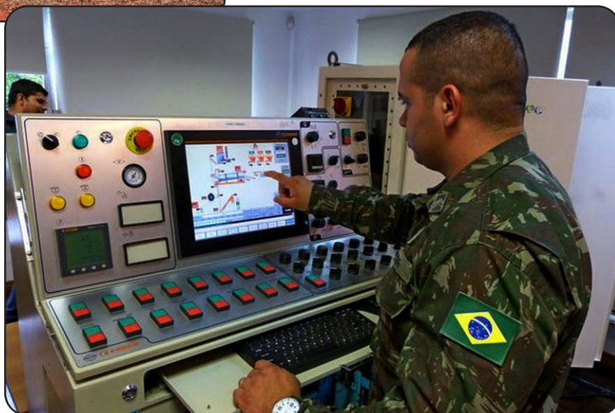
An NCO operates an asphalt plant during the Asphalt Paving Course at the CI Eng/EB.