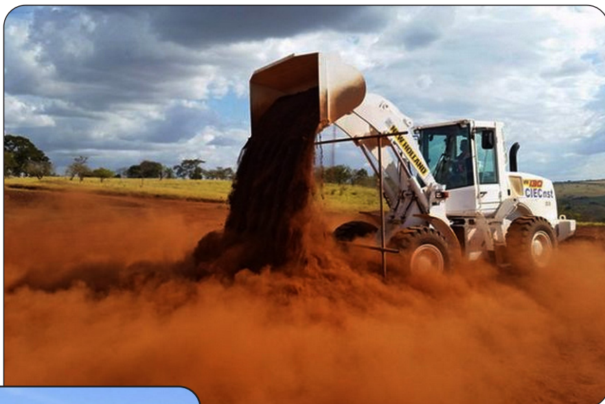
A student performs a task during the Heavy Engineer Equipment Course.