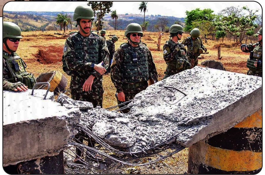
An instructor evaluates the results of a bridge demolition examination during the Explosives Operation Course.