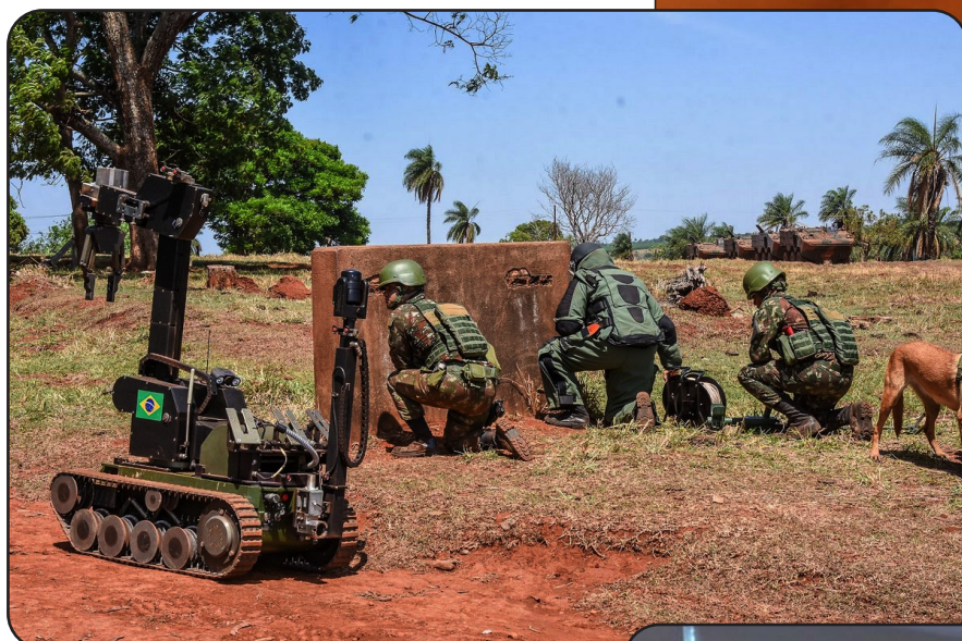
An engineer team practices an explosive ordnance disposal task supported by a robot and a mine detection dog during a multidisciplinary exercise.