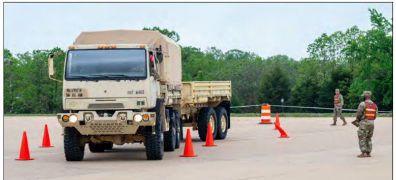
Staff Sgt. Zevian Pettway completes the reverse serpentine event, when the driver must pull forward in an S shape, avoiding the markers, and reverse in the same manner, completing a figure eight.