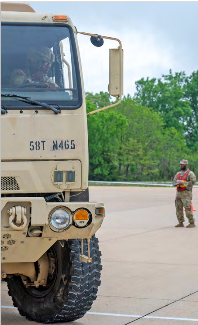
Staff Sgt. Ladarrius Campbell navigates the question mark alley backing event, when drivers must pull forward and make a wide left turn and then reverse the vehicle and trailer into the parallel parking position.