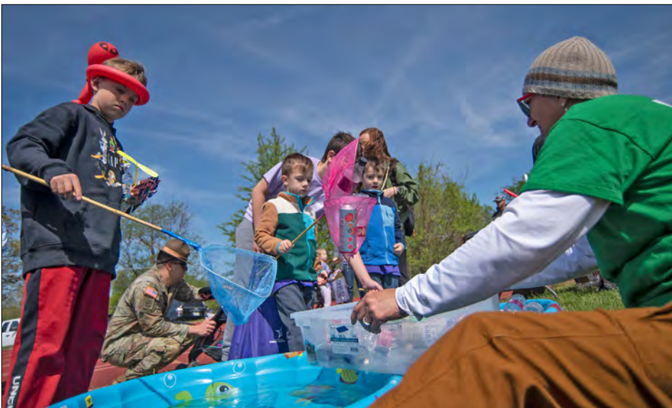
Above: Children fish litter from pools while learning about the importance of keeping their environment clean during the MOMC-palooza celebration April 20 on Gerlach Field.

More than 70 Fort Leonard Wood organizations came together April 20 on Gerlach Field to help celebrate Month of the Military Child and Earth Day.