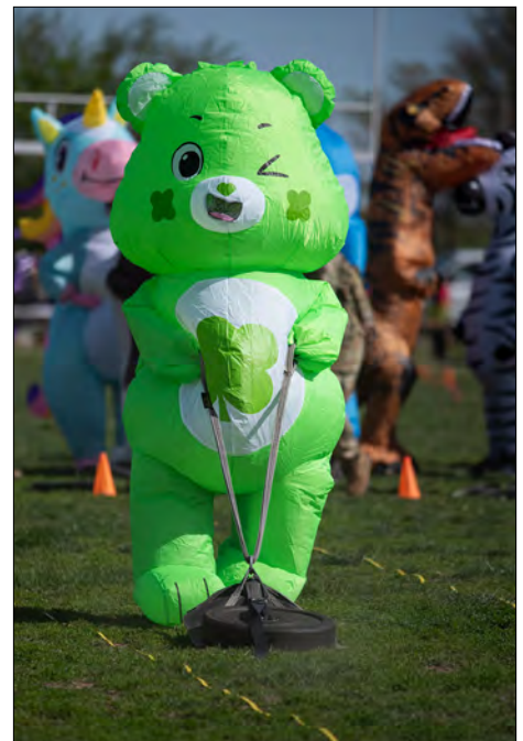
Right: Children weren't the only ones trying out their Army Combat Fitness Test skills.