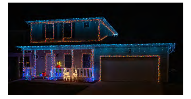
An Eagle Point neighborhood resident makes sure both stories of this home have plenty of holiday illumination.