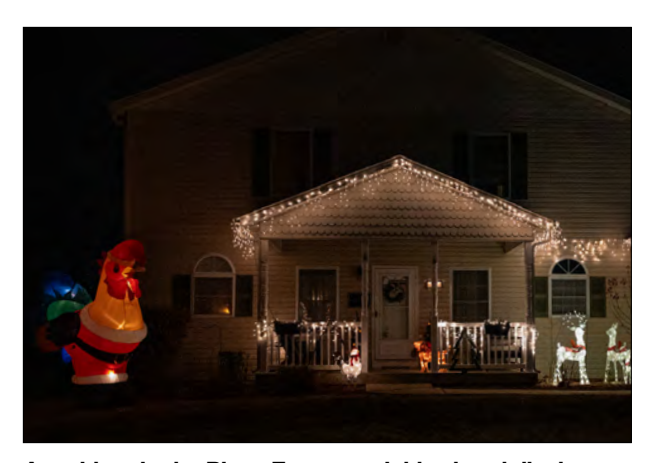
A resident in the Piney Estates neighborhood displays an air-blown Santa rooster as tall as the first floor of the home.