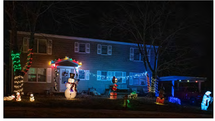
Families in the South Lieber Heights neighborhood are greeted by a six-foot lighted snow man in front of this home.