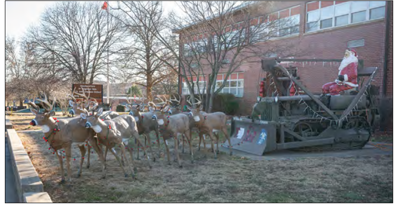
The 1st Engineer Brigade shows that Santa can ride Army Engineer equipment just as well as a sleigh.