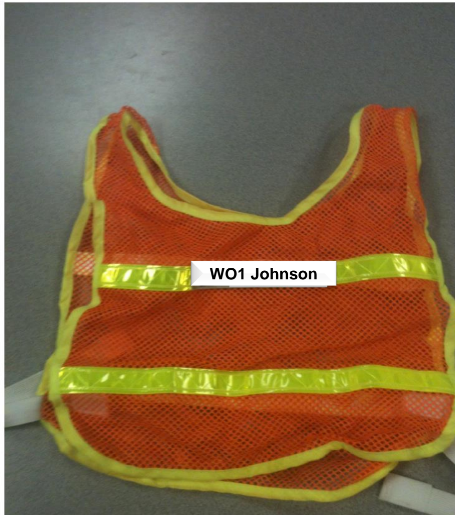
PT Reflective Vest Example