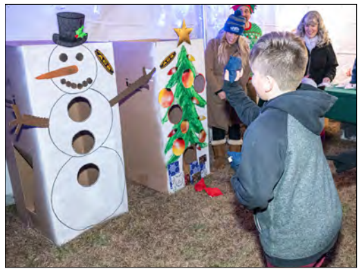
In addition to the tree lighting, organizations here set up activities, such as bean bag toss, miniature golf and ornament making.