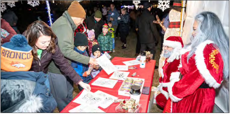
Mr. and Mrs. Santa Claus pass out coloring pages to attendees.