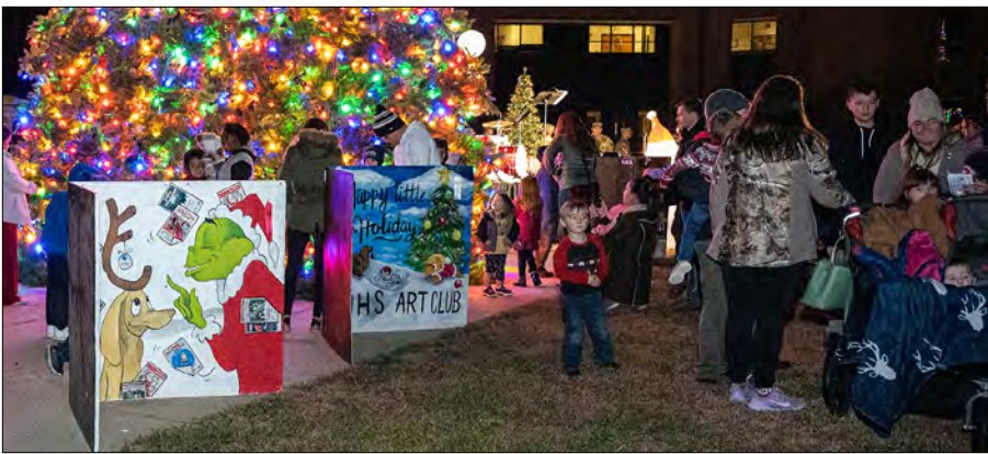
This year’s Cards to the Community contest winner was decorated by Soldiers with the 43rd Adjutant General Battalion (Reception).