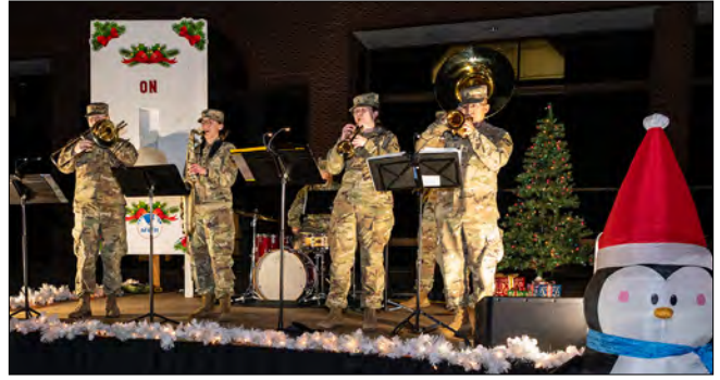
Soldiers with the 399th Army Band perform festive holiday music prior to the tree lighting.