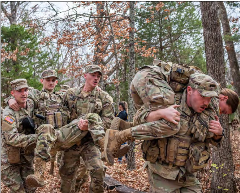
Marquette University cadets, part of the nine-person team, carry their teammates to the finish line of the Hand Grenade Assault Course Friday on Range 31 during the 3rd Brigade ROTC Ranger Challenge competition.

Army ROTC cadets from Missouri and other Midwest-region states competed on Fort Leonard Wood Friday and Saturday in the U.S. Army Cadet Command's 3rd ROTC Brigade Ranger Challenge. The military skills competition consisted of 14 events including weapon's skills, a hand grenade course and physical endurance events.