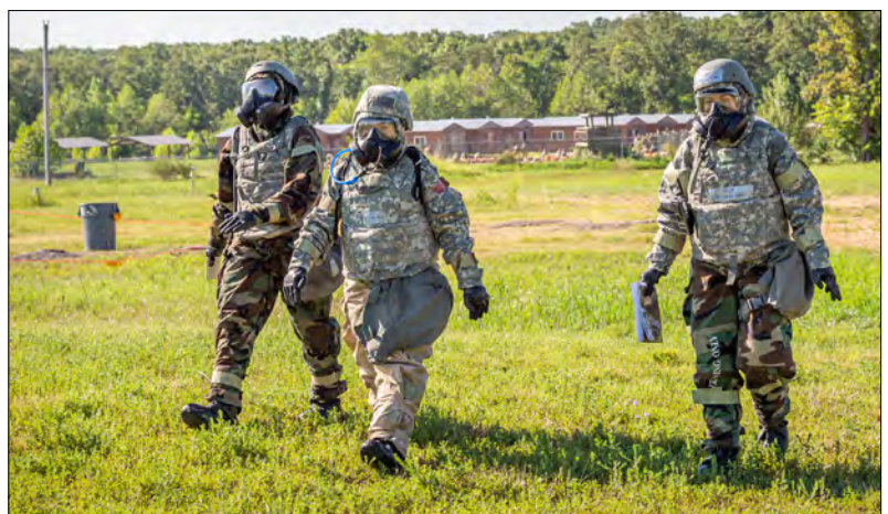
Emergency Management students check routes for CBRN contamination during threat detection grid training Monday at TA 219.