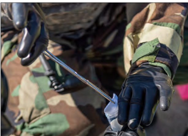
Emergency Management students place a particulate filter into a tube for simulated testing during radiological sampling training Monday at TA 219.