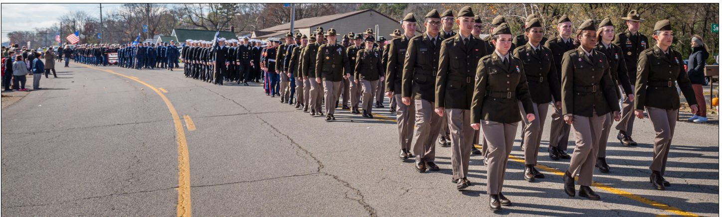
Above: More than 100 Fort Leonard Wood service members march along U.S. Route 66 through Waynesville during the parade. This event has been held almost every year since 1997, and alternates locations between the cities of Waynesville and St. Robert.

Fort Leonard Wood service members participate in Friday's Waynesville-St. Robert parade.