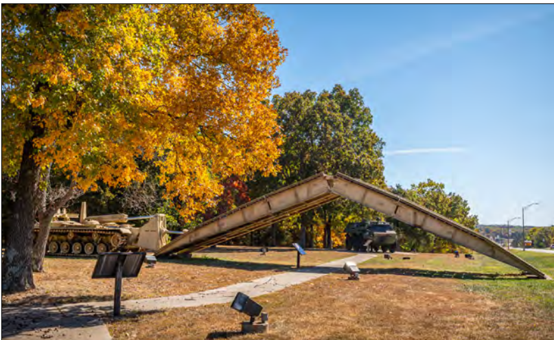
Army bridging and tactical vehicle static displays sit along the north gate outbound lanes on Missouri Avenue.