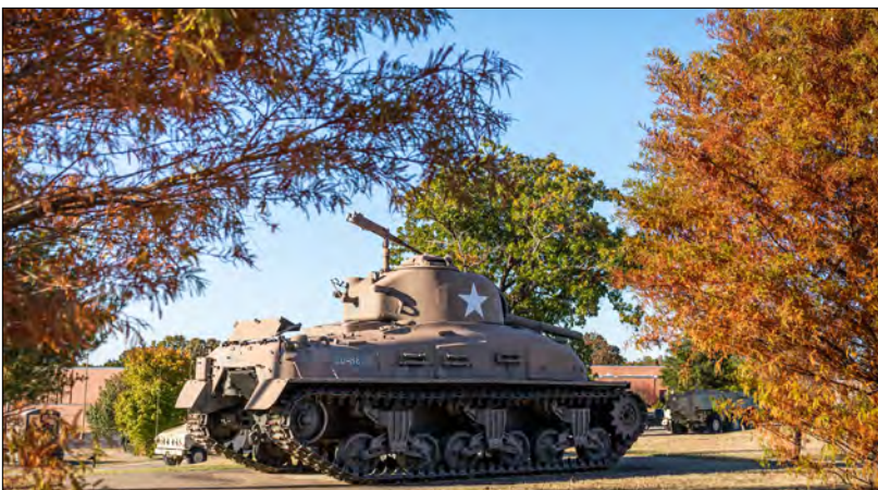
Above: A Sherman tank is one of many static displays near the John B. Mahaffey Museum Complex.