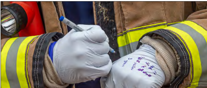
A firefighter makes note of simulated injured personnel on one of his gloves while responding at Forney Airfield.

Fort Leonard Wood first responders triage Soldiers with simulated injuries May 25 in a parking lot at Forney Airfield as part of an installation-wide integration protection exercise. The scenario, which involved simulating destruction caused by a tornado, helped agencies to be more prepared for natural disasters, and to practice protection measures to keep people safer.