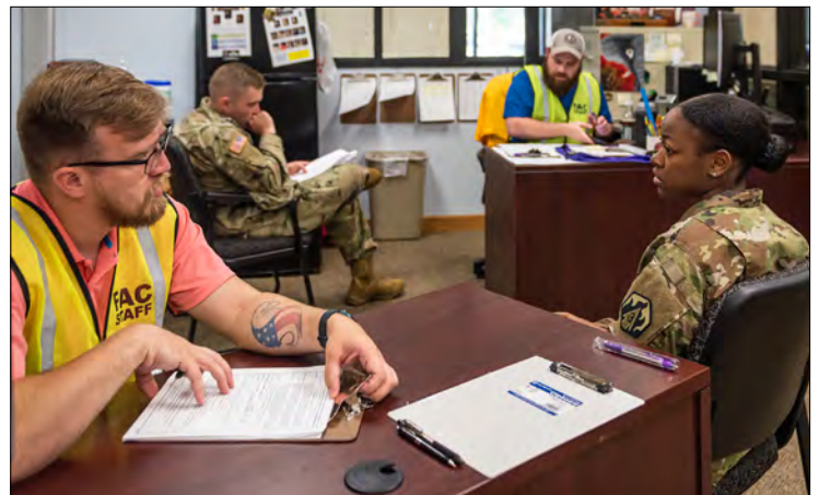
Army Community Service staff assist Soldiers role-playing as displaced personnel at a mock Emergency Family Assistance Center at Davidson Fitness Center.

Fort Leonard Wood tests its emergency response plans