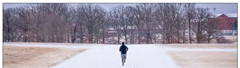
A runner makes his way across Gammon Field.