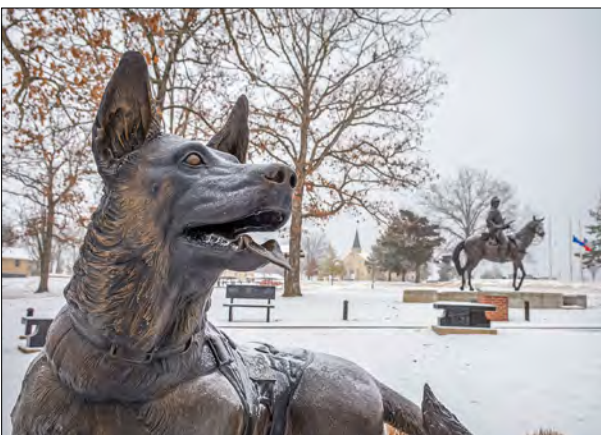
Snow falls on Memorial Grove on Feb. 24, including the Fallen Sapper Memorial (above), the Chemical, Biological, Radiological and Nuclear Regiment's war-torn tree memorial (above left), and the Military Working Dogs monument (bottom left). Top right: The water tower near Forney Airfield.