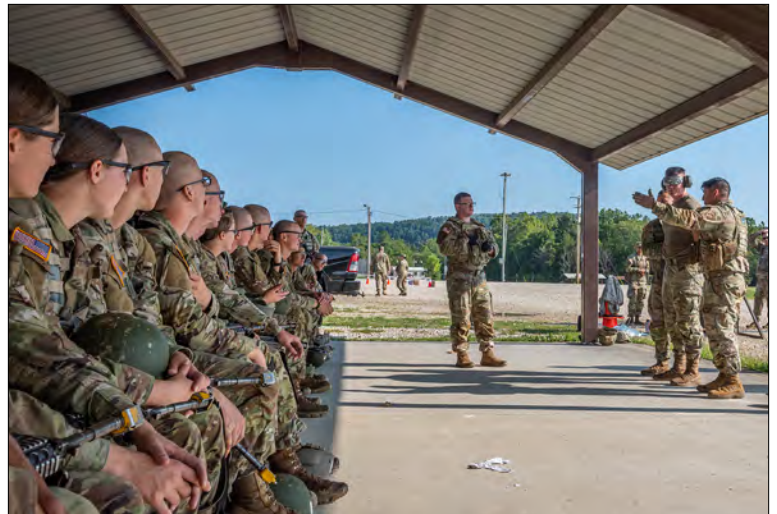
Above: Bravo Company trainees watch a demonstration of a point-of-contact transfer of a high-value target with military police detention and corrections operations instructors from Company C, 701st Military Police Battalion Wednesday at TA 250.