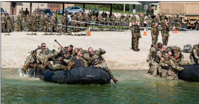
In addition to learning how to build and use poncho rafts, the trainees were given a lesson on Zodiac boats as well.

Company B, 35th Engineer Battalion, executed their culminating training event, the combat engineer field-training exercise, or CEFTX, this week, and company leadership lined up a couple of extra training opportunities to help expand the trainees' skills and provide more tools for their toolbox.