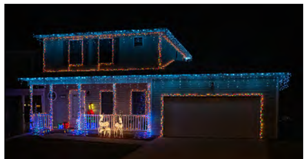
An Eagle Point neighborhood resident makes sure both stories of this home have plenty of holiday illumination.