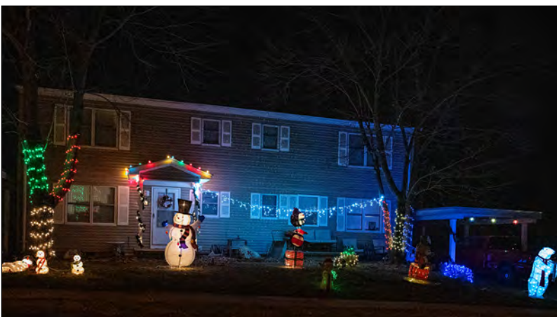
Families in the South Lieber Heights neighborhood are greeted by a six-foot lighted snow man in front of this home.