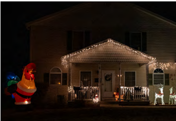
A resident in the Piney Estates neighborhood displays an air-blown Santa rooster as tall as the first floor of the home.