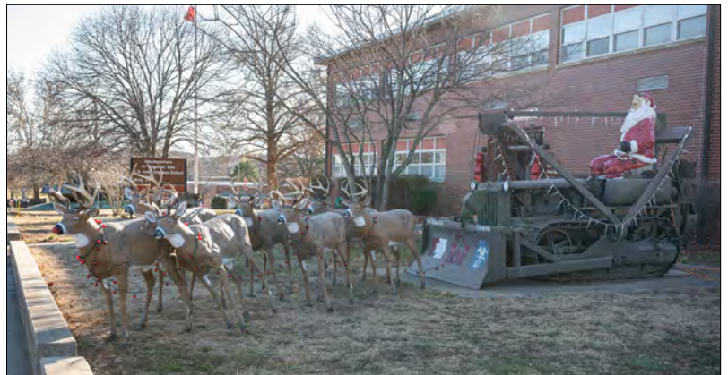
The 1st Engineer Brigade shows that Santa can ride Army Engineer equipment just as well as a sleigh.