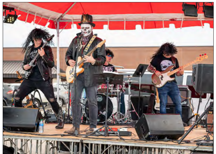
The 39th Army Band’s rock band, the Rough Riders, provide some spooky tunes to entertain families attending the FMWR trunk-or-treat event Friday in the Main Exchange parking lot.