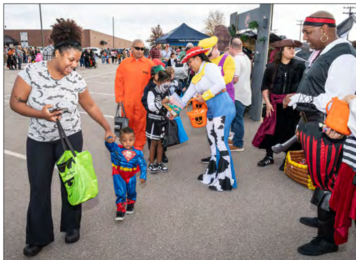
Trick-or-treaters make their way around more than 30 stations decorated at the Family and Morale, Welfare and Recreation trunk-or-treat event Friday in the Main Exchange parking lot.