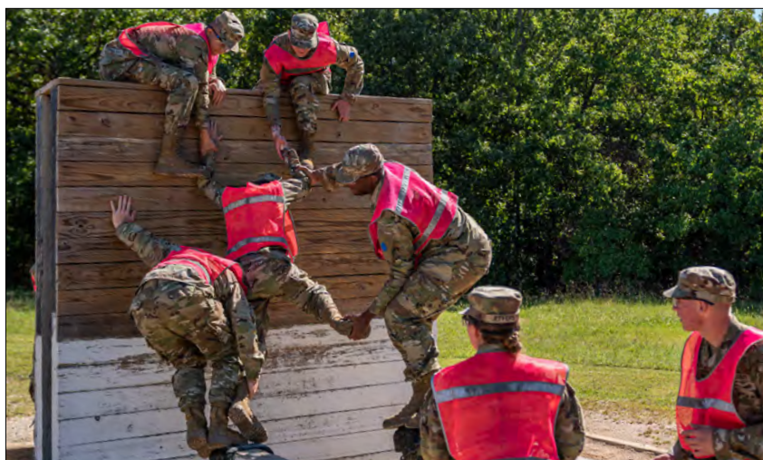
Trainees lower a teammate onto a beam from the top of a wall. Participants on the course are prohibited from touching any part of the obstacle that is painted white while trying to complete the challenge.