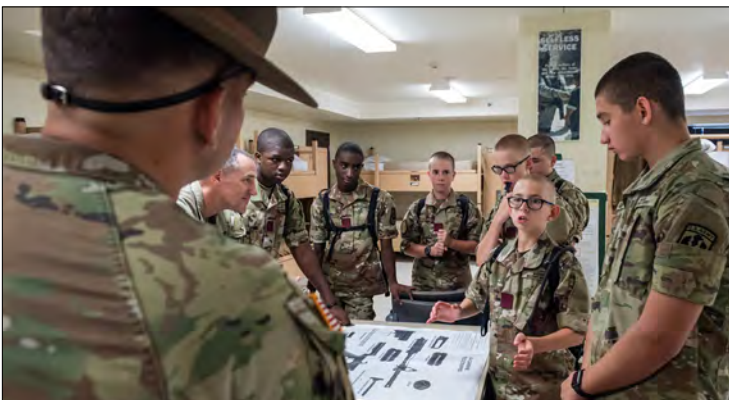
Students from the Missouri Military Academy in Mexico, Missouri, tour a Basic Combat Training barracks and interact with cadre from the 2nd Battalion, 10th Infantry Regiment.