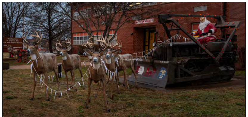
Santa Claus and his reindeer try a different kind of sled Monday outside the 1st Engineer Brigade headquarters building along Iowa Avenue.