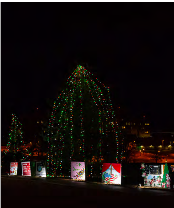
This year’s Cards to the Community entries stand visible Tuesday evening along Constitution Avenue.