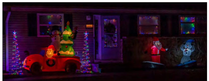
A family in the South Lieber Heights neighborhood demonstrates Tuesday evening how Santa Claus can be in two places at once. Holiday decorating regulations for on-post housing residents can be found in the Fort Leonard Wood Homes Community Guidelines handbook.