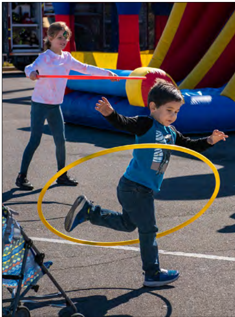
Above: Children at Fire Fest enjoy some time with hula hoops. Event organizers provided many different activities for the whole family.

The Fort Leonard Wood community gathered Saturday in the Main Exchange parking lot to tour some of the installation's emergency vehicles, meet firefighters and enjoy games, facepainting, free food and refreshments provided by the USO. The 399th Army Band Rock Band, "The Roughriders," also performed.