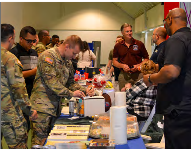
Exhibition attendees learn about available resources from staff with Army Community Service, the Sexual Harassment and Assault Response and Prevention Program, the Army and Air Force Exchange Service, Defense Commissary Agency and the Army Substance Abuse Program.