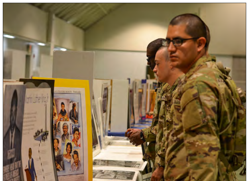
Trainees from Company C, 3rd Battalion, 10th Infantry Regiment, look over some of the exhibits on display.