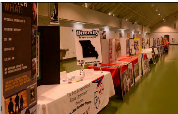
Informational displays highlight the diverse cultural background of America's history.