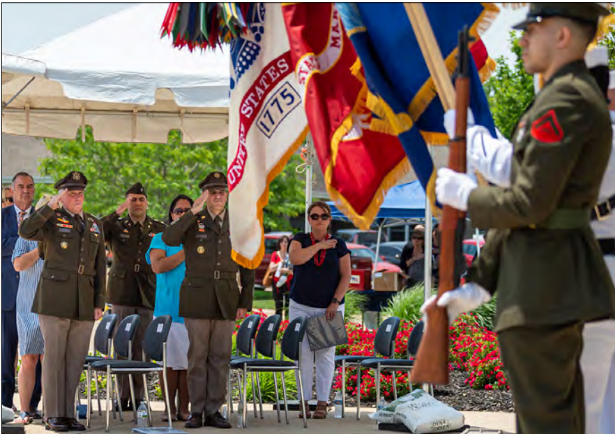
As a joint-service color guard presents the flag, attendees at the Memorial Day ceremony render honors during a performance of the national anthem.