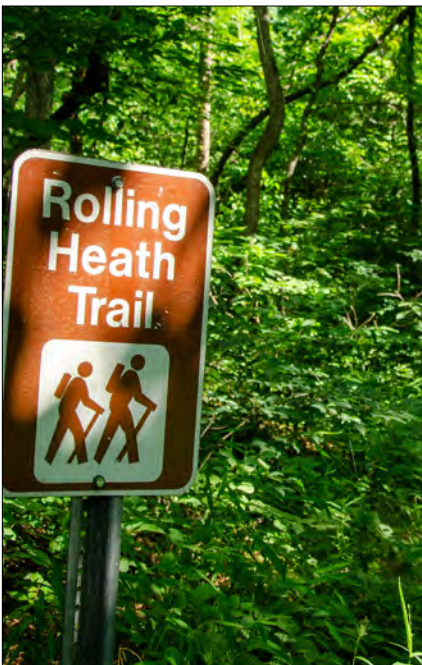
Rolling Heath Trail begins behind Rolling Heath School off FLW 28 and connects to Sandstone Spring Trail.

Fort Leonard Wood trails offer fun, fitness and great views to those looking to explore the great outdoors.