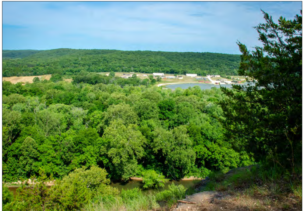
The view from the overlook along Stone Mill Spring Trail. The trail begins near Stone Mill Spring.