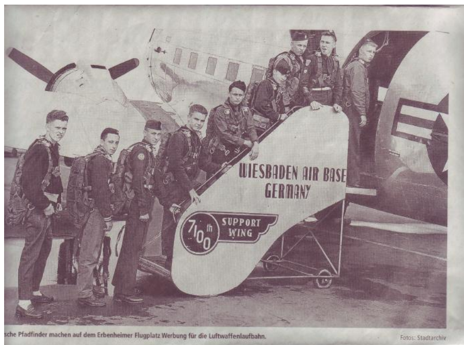
Right picture—1954: American boy scouts posing for an Air Force flight line poster at the Erbenheim Airfield.