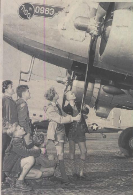
1955: Deutsche Jungen besichtigen Flugzeuge auf der US-Airbase Erbenheim.

sem umfasst. Denn mit dem Umzug wird sich die Zahl der Mitglieder der US-Gemeinde in Wiesbaden deutlich erhöhen – nach amerikanischen Prognosen von jetzt 16000 auf etwa 20000 im Jahr 2015. Das wieder-