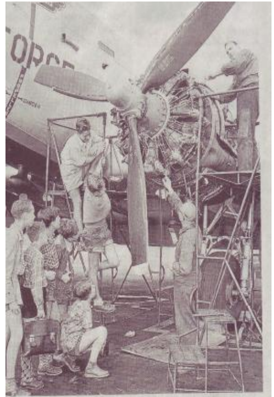
Right picture-- 1955: students from Dilthey were allowed to watch mechanics at the Air Base