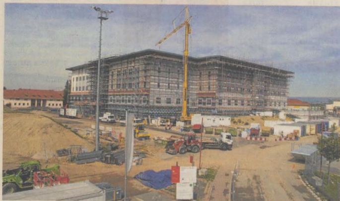
2011: Das neue Headquarter für die US-Landstreitkräfte in Europa soll im Herbst kommenden Jahres bezugsfertig sein.