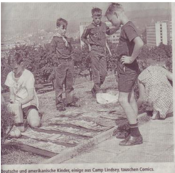
Right picture—1956: German and American children, some from Camp Lindsey, exchanging comics.