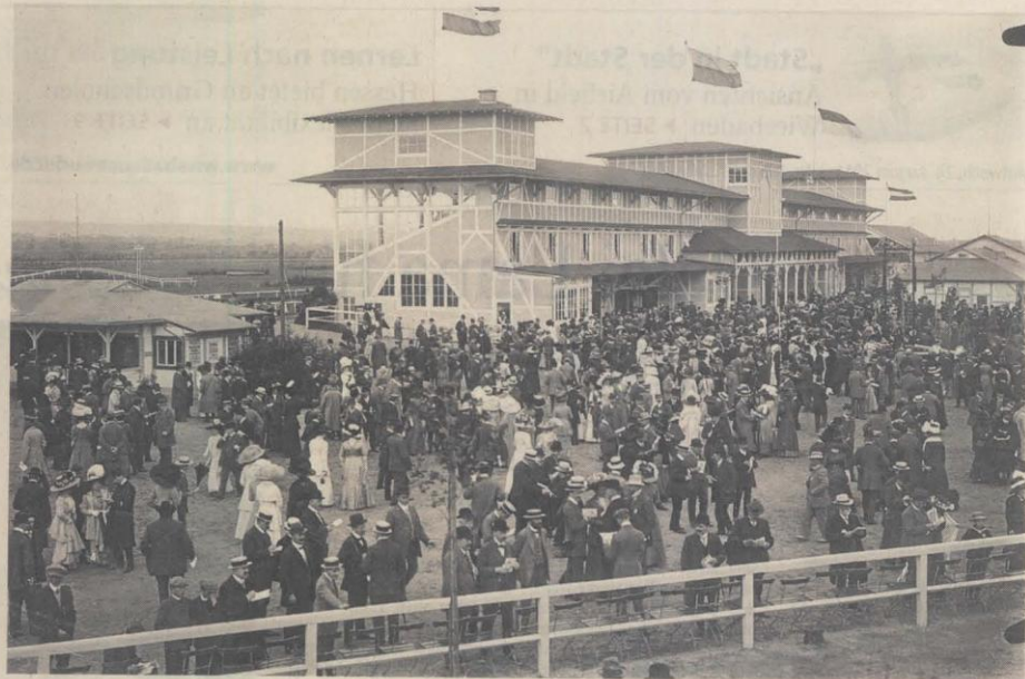
1912: Buntes Treiben auf der 1910 eröffneten Pferderennbahn.

Bereits vor dem 1. Weltkrieg suchte Wiesbaden nach einer anderen Nutzung der Pferderennbahn, die sich nach anfänglichem Boom nicht recht rentieren wollte, und leitete damit die Geschichte des Flugplatzes Erbenheim ein: Zusammen mit