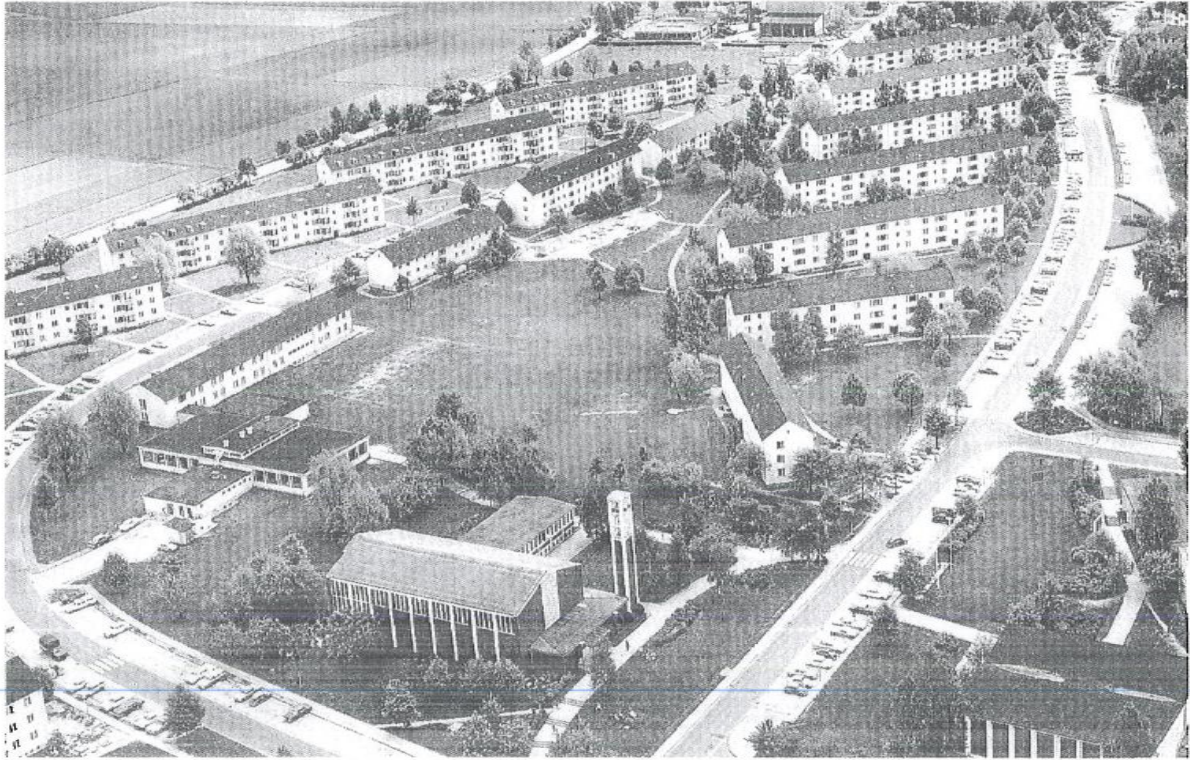
Die Luftaufnahme aus dem Jahr 1971 zeigt die für die 50er Jahre neue Struktur der US-Großsiedlung Hainerberg.