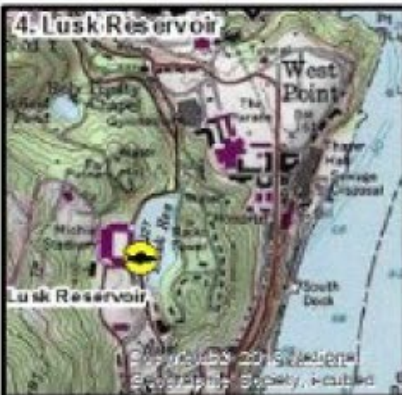
4. Lusk Reservoir