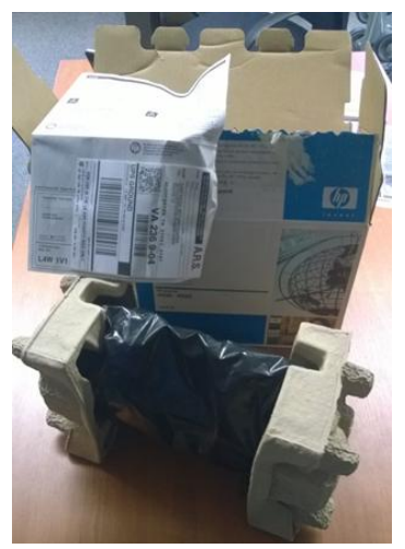
Used Cartridge wrapped and ready to be returned

Please help reduce costs and trash by recycling tires. Do not throw tires into the dumpster.