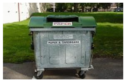
Paper & Cardboard Container