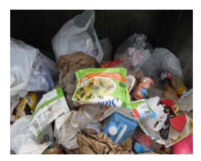
Avoid mixing waste: Plastic items in Regular Trash