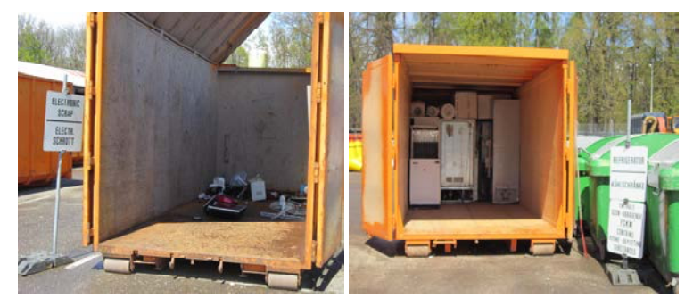
Container for Electronic Scrap