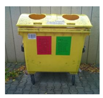
Container for Plastics