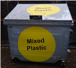
Container for Plastics