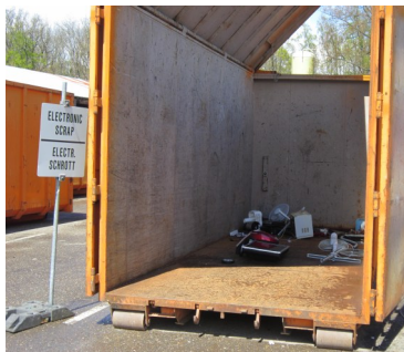
Container for Electronic Scrap