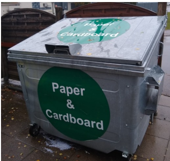
Paper & Cardboard Container