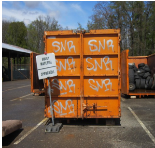
Container for Bulky Items