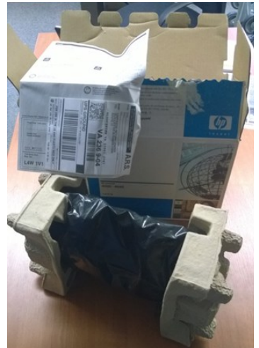
Illustration of used cartridges that are wrapped and ready to be returned.

Disposal locations on-post are listed on page 19.