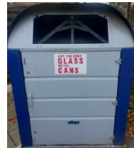
Glass & Metal Container

Note: Large/heavy metal items go into the scrap metal container (see page 12).