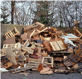
Scrap Wood Collection