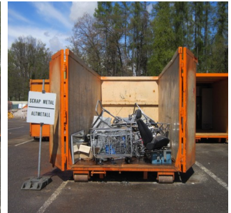
Container for Metal Scrap

Note: Central Receiving Facility for government-owned items is located at Panzer Kaserne, Bldg. 2956.