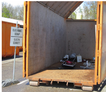
Container for Electronic Scrap