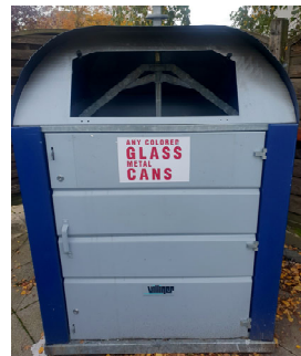
Glass & Metal Container