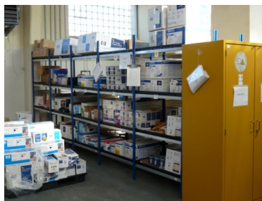
Hazardous Reuse Center at Panzer Kaserne in Bldg. 2958