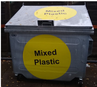
Container for Plastics