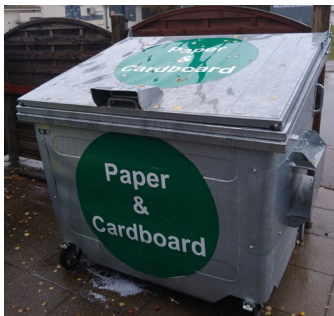
Paper & Cardboard Container