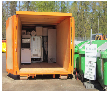
Container for Refrigerators and Air Conditioners

Note: If you are not able transport large items, call the installation coordinator (IC) at your installation location (see back page of this booklet for appropriate POC).