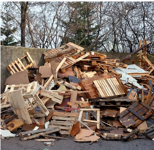
Scrap Wood Collection