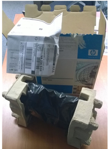
Illustration of used cartridges that are wrapped and ready to be returned.

Disposal locations on-post are listed on page 19.