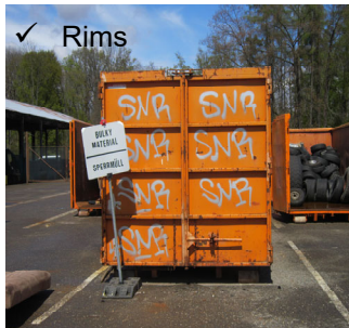
Container for Bulky Items