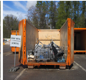
Container for Metal Scrap

Note: Central Receiving Facility for government-owned items is located at Panzer Kaserne, Bldg. 2956.