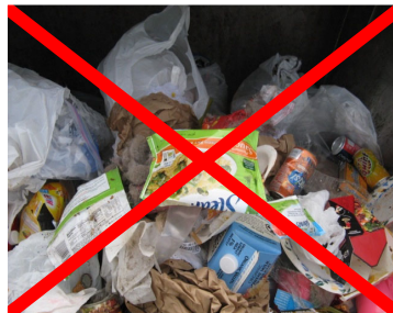
Avoid mixing waste: Plastic items in Regular Trash