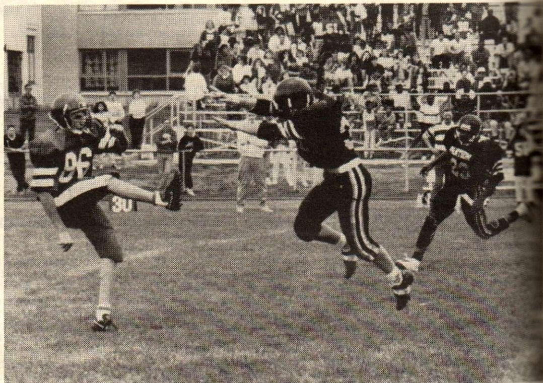
The Panthers attack, but Stuttgart's punter gets the ball off.