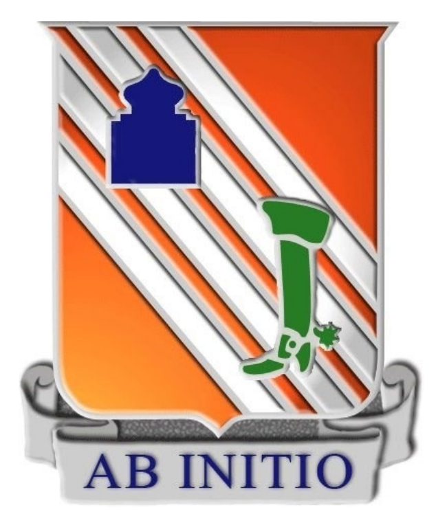
"From the Beginning"