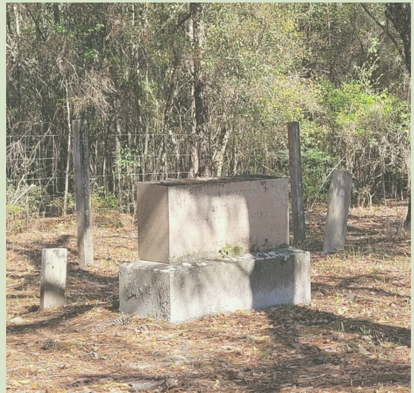
Wells and Green Bay Cemeteries