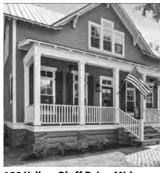
158 Yellow Bluff Drive Midway - $499,900 UNDER CONTRACT Looking for the perfect coastal

This 3 bedroom, 1.5 bath brick home is an excellent investment opportunity. Conveniently located within the city limits in an established neighborhood. Don't let this one pass you by! Jimmy Shanken at 912-977-4733 cell or Jimmy.shanken@theshankenteam.com