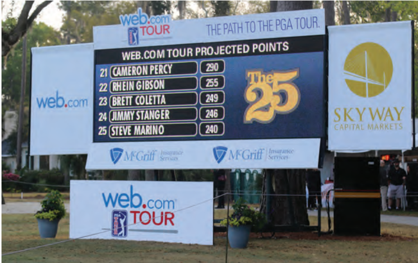
Above: The Web.com Savannah Golf Championship provides a path to the PGA tour for the top 25 players.