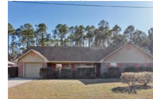
927 Highland Drive Hinesville - $129,900

ing room. This home features an over-sized master bedroom that is large enough for sitting room furniture. It is a perfect spot to read, catch up on correspondence, or simply relax. Outside this home you will find a privacy, wood fence and a 16X34 shed. Opportunity is knocking, don't miss out! Jimmy Shanken, Coldwell Banker Holtzman REALTORS, 912-368-4300 or 912-977-4733 or email jimmy.shanken@coldwellbanker.com