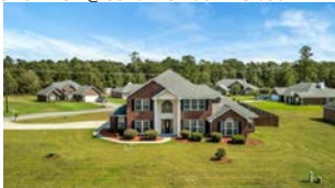
52 Barton Court Hinesville - $297,500

This beautiful 3 bedroom, 2.5 bathroom home is located in the Villages on Marne subdivision. This home features an eat-in kitchen, carpet and wood laminate floors, a 2 car garage and fenced backyard. The master bedroom has a sitting room and separate tub. The laundry room is located downstairs. Jimmy Shanken, Coldwell Banker Holtzman REALTORS, 912-368-4300 or 912-977-4733 or email jimmy.shanken@coldwellbanker.com