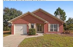
402 Clairemore Circle Hinesville - $135,000

Newly listed, fabulous home in a well established neighborhood. Well kept 3 bedroom 2 1/2 bathroom home with an amazing yard to include a partial screened in patio and sprinkler system. Jimmy Shanken, Coldwell Banker Holtzman REALTORS, 912-368-4300 or 912-977-4733 or email jimmy.shanken@coldwellbanker.com