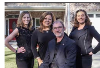
The Shanken Team REALTORS®

Lot 10 Youmans Road, Midway - $249,900. Beautiful marsh front lot, located about 20 minutes from Hinesville and within close proximity to I-95. Breath taking views; a perfect lot to build our dream home