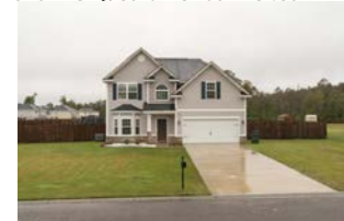
953 Mustang Lane NE Ludowici - $229,900

DREAM STARTER! This is a stunning, updated three bedroom two in a half bath home. It showcases a family room where you can get away without going away, one your family will love and enjoy. The warm, cozy living room features a wood burning fireplace that says, "stay awhile!" This home features a beautiful wrap around driveway. Entertain, relax, and enjoy all the benefits of owning a home with a salt water, in ground pool, outdoor shower, and a one studio bedroom one full bath pool house. The landscape is immaculate and has a manicured garden. It provides a wonderful opportunity to celebrate family holidays and start new traditions so, don't miss out! This home is located in the center of Hinesville. Jimmy Shanken, Coldwell Banker Holtzman REALTORS, 912-368-4300 or 912-977-4733 or email jimmy.shanken@coldwellbanker.com