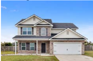
1063 Marne Boulevard Hinesville - $179,900

Charcoal steaks never tasted as good as when cooked in your own backyard with a nice patio. Let this home be your home. It is perfect for starting new family traditions! This home is located near Ft. Stewart Gate 7. Jimmy Shanken, Coldwell Banker Holtzman REALTORS, 912-368-4300 or 912-977-4733 or email jimmy.shanken@coldwellbanker.com