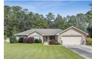
863 Flora Ellen Street Hinesville - $219,900

3 bedroom, 2 bathroom charming home located in the Floyd subdivision. The cozy home features tile and laminate floors, beamed ceiling, a fireplace in the living room and sliding glass doors that look out onto a beautiful backyard. It is having a new electric HVAC system put in as well as a new electric water heater. The interior will also be repainted. Less than 5 minutes away from Ft Stewart main gate! NO HOA's makes it easy on the pocket book. Jimmy Shanken, Coldwell Banker Holtzman REALTORS, 912-368-4300 or 912-977-4733 or email jimmy.shanken@coldwellbanker.com