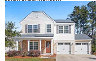
204 Mosswood Drive Savannah - $284,900

A MUST SEE. This is a unique three bedroom, two bath, and one car garage home. This home features a warm, cozy fireplace inviting to friends and family. The step saver kitchen showcases a big window and the perfect view of the landscaped backyard. Outside you will find an attached, enclosed patio and a wooden, privacy fence ideal for young children and hosting events. This home is exciting and would be wonderful for starting new family traditions and having family home for the holidays. This home is located near Gate 8 in Hinesville. Jimmy Shanken, Coldwell Banker Holtzman REALTORS, 912-368-4300 or 912-977-4733 or email jimmy.shanken@coldwellbanker.com