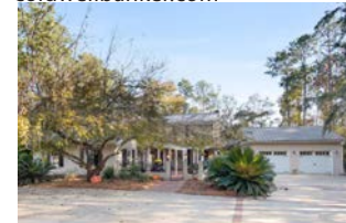
386 Fox Hollow Circle Hinesville - $399,900

A MUST SEE! A stunning, well maintained three bedroom two bath home. The inviting living room radiates hospitality and charm and also features a warm, cozy fireplace and showcases a large, arched window. The kitchen has everything a cook could want - stove, refrigerator, and dishwasher within reach. Outside is a screened porch and a backyard privacy fence, perfect for a quiet afternoon with a cool breeze. This home is great for celebrating family holidays and starting new traditions. It is located in a secluded subdivision in Long County. Jimmy Shanken, Coldwell Banker Holtzman REALTORS, 912-368-4300 or 912-977-4733 or email jimmy.shanken@coldwellbanker.com