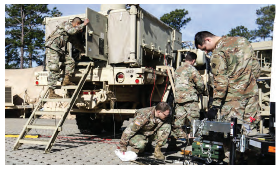
Left and above: 3rd ID Soldiers disconnect generators and pack-up vehicles, Feb. 15, following Warfighter 19-03 as they retrograde from Fort Bragg, N.C.