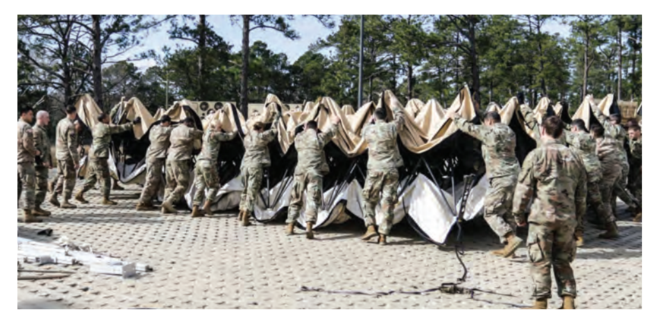
Soldiers use teamwork to collapse the division command post, Feb. 15 as they retrograde from Fort Bragg, N.C. during Warfighter 19-03.

Soldiers break down the division command post, Feb. 15 as they retrograde from Fort Bragg, NC. during Warfighter Exercise 19-03. The 3rd Infantry Division supported the capstone training exercise with a trained battle staff to simulate realistic planning, coordination, and execution across the multi-domain battlefield.