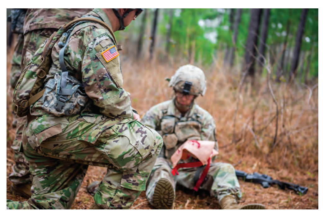
Above: A Soldier prepares to apply a simulated injury to his leg, Feb. 12, as Soldiers from Fort Benning, Fort Stewart and the National Guard, train on various tactical lanes Feb. 12, on Fort Benning.

Soldiers from Fort Benning and Fort Stewart and the National Guard, train on various tactical lanes Feb. 12 on Fort Benning. Soldiers will be tested on these same tasks, Feb. 25 – March. 1, during the Expert Infantryman Badge assessment.