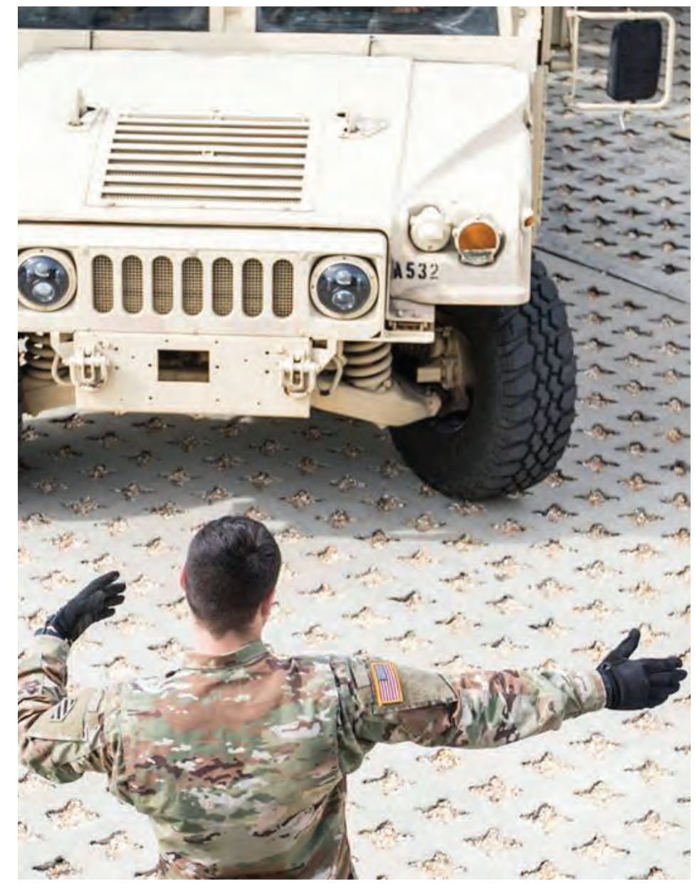
A Soldiers ground-guides a vehicle, Feb. 15 as they retrograde from Fort Bragg, N.C. during Warfighter 19-03.