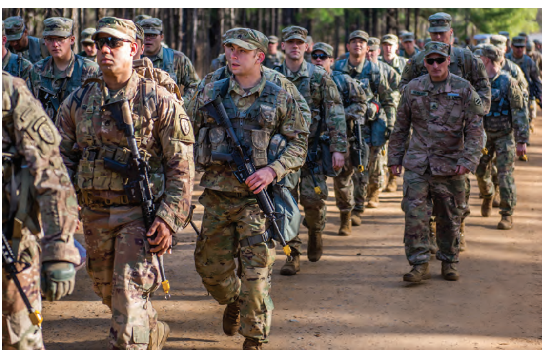
Above: Soldiers from Fort Benning and Fort Stewart and the National Guard, ruck march, Feb. 12, at Fort Benning as they prepare for the Expert Infantry Badge assessment scheduled on Fort Benning, Feb. 25 - March 1.

Left: A Soldier applies camouflage to his face, Feb. 12 on Fort Benning, as he and other Soldiers from Fort Benning, Fort Stewart and the National Guard, train on various tactical lanes in preparation for the Expert Infantry Badge assessment, scheduled Feb. 25 - March 1 on Fort Benning.