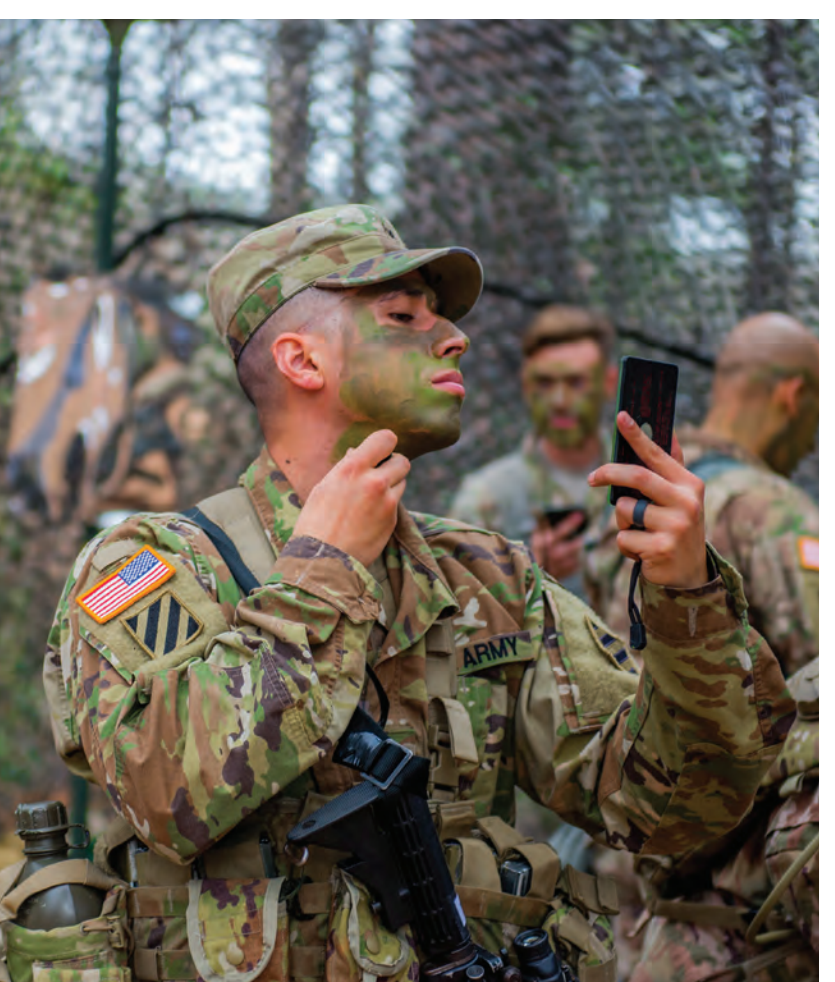
Soldiers from Fort Benning and Fort Stewart and the National Guard, train on various tactical lanes Feb. 12 on Fort Benning. Soldiers will be tested on these same tasks, Feb. 25 - March. 1, during the Expert Infantryman Badge assessment.