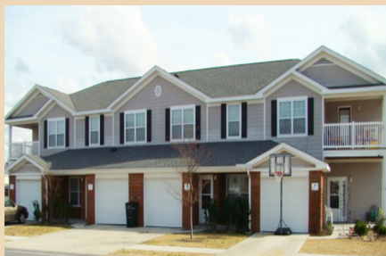
Hunter Army Airfield