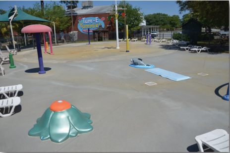
Spray Park Facility

Everyday throughout the world, nations are facing water problems in terms of both quantity and quality. Between 1950 and 1970, global water demand tripled and is expected to double within 35 years. Although 75 percent of the earth is covered by water, only 1 percent is available as renewable fresh water, and only about one-third of all precipitation that falls on the land goes back to the oceans by rivers and runoff. We are a nation whose water needs are rapidly rising while available supplies are shrinking; regional water crises are becoming increasingly frequent as water tables are falling and stream flow is decreasing. We can no longer take our drinking water for granted. This means that individuals, municipalities, industries, and governments must be proactive in conserving and protecting our water supplies. The consequences of recurring long duration droughts are far-reaching, affecting wildlife, vegetation, and humans. Additionally, drought impacts on society are often exacerbated by the demand that people place on the water supply. Water is one of the most precious commodities we have on this planet; we ought not to treat it as if it were an unlimited resource. By shifting our priorities for water usage, we can prevent water scarcity. The well has run dry in many places—let's not make our community next!