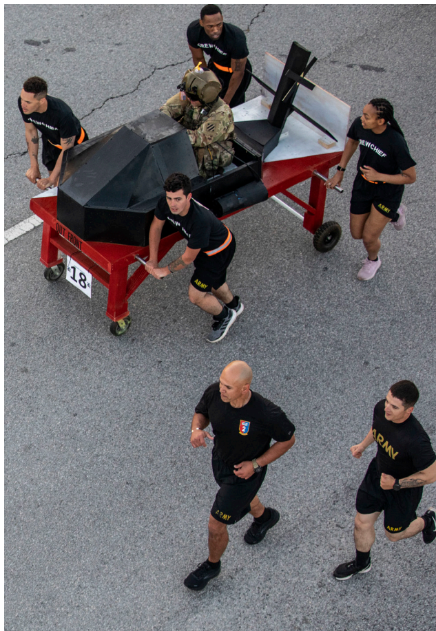
Above: Soldiers assigned to 3rd Squadron, 17th Cavalry Regiment, 3rd Combat Aviation Brigade, 3rd Infantry Division, push their squadron's bed during the Bed Race, May 17 on Fort Stewart.