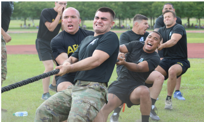
Soldiers assigned to 1st Battalion, 28th Infantry Regiment, 3rd Infantry Division, from Fort Benning, compete in a tug-of-war event during Marne Week, May 17 on Fort Stewart.