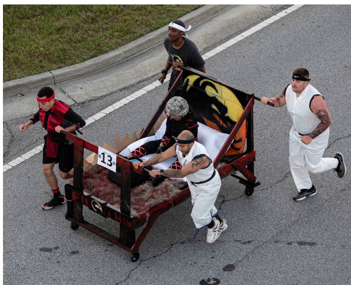
Right: Soldiers assigned to Fort Stewart's U.S. Army Medical Department Activity push their unit's bed during the Bed Race, May 17 on Fort Stewart. The bed race kicked off Marne Week standing in as a fun alternative to the traditional division run.