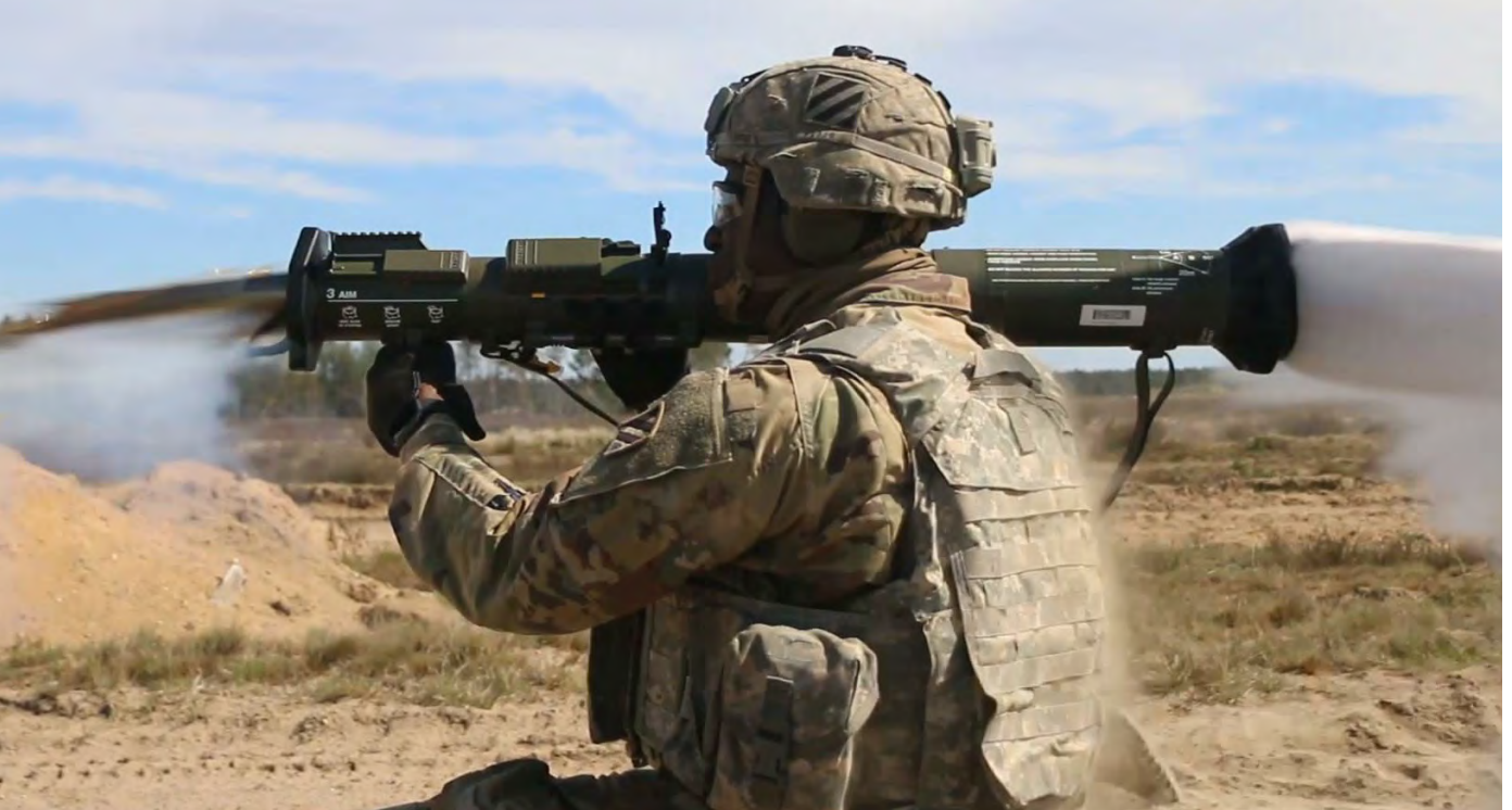
Above: Soldiers from 6-8 CAV fired the AT4 Light Anti-Armor Weapon, a portable, single-shot, disposable anti-tank rocket launcher at Mielno Range, Drawsko Pomorski Training Area, Poland.

Left: Cavalry Scouts continue to train, develop, and demonstrate their proficiency and skills on a multitude of weapons systems, including the AT4.