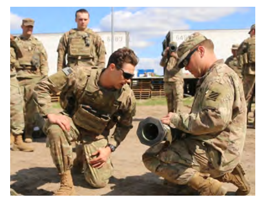
Soldiers from 6-8 CAV fired the AT4 Light Anti-Armor Weapon, a portable, single-shot, disposable anti-tank rocket launcher at Mielno Range, Drawsko Pomorski Training Area, Poland.