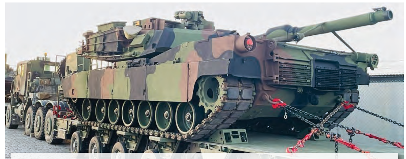
An M1 Abrams main battle tank sits on the back of a military Heavy Equipment Transport line-haul truck at Coleman work site in Mannheim, Germany.

"It is incredible to see so many diverse organizations come together to enable our team to rapidly receive, stage and issue an ABCT's worth of equipment to 1st