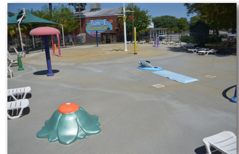
Spray Park Facility

Everyday throughout the world, nations are facing water problems in terms of both quantity and quality. According to a report from the Organization for Economic Cooperation and Development, by 2050 water demands are expected to increase by 400 percent from manufacturing and by 130 percent from household use (from a baseline year of 2012). Although 75 percent of the earth is covered by water, only 1 percent is available as renewable fresh water, and only about one-third of all precipitation that falls on the land goes back to the oceans by rivers and runoff. We are a nation whose water needs are rapidly rising while available supplies are shrinking; regional water crises are becoming increasingly frequent as water tables are falling and stream flow is decreasing. We can no longer take our drinking water for granted. This means that individuals, municipalities, industries, and governments must be proactive in conserving and protecting our water supplies. The consequences of recurring long duration droughts are far-reaching, affecting wildlife, vegetation, and humans. Additionally, drought impacts on society are often exacerbated by the demand that people place on the water supply. Water is one of the most precious commodities we have on this planet; we ought not to treat it as if it were an unlimited resource. By shifting our priorities for water usage, we can prevent water scarcity. The well has run dry in many places—let's not make our community next!