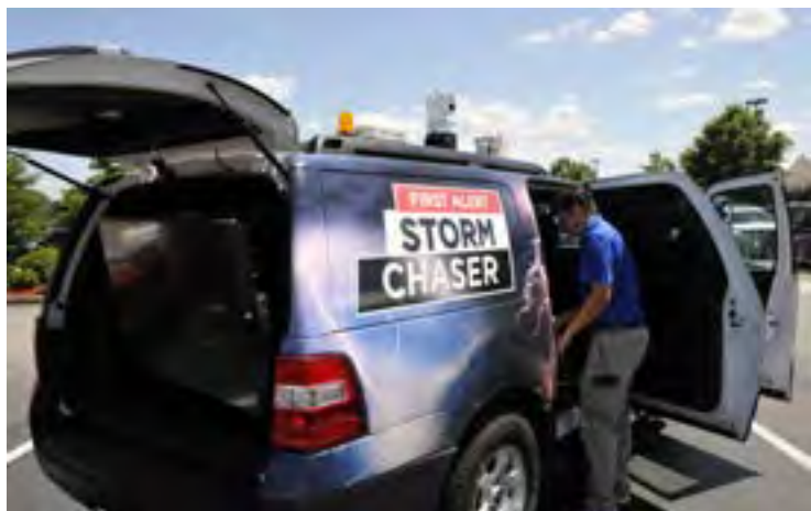
Top left, right and above: The national weather service in Charleston SC has confirmed a tornado touchdown on Fort Stewart in Liberty County, Feb. 3, 2016. Left: WTOC Storm Chasers were a popular display, June 14, 2019, at the Liberty County Hurricane Preparedness Expo.