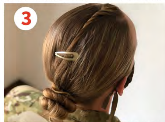
BUN WITH TWISTED, PINNED BACK BANGS