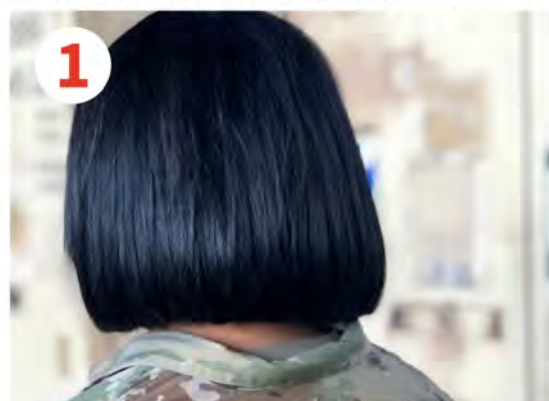
MEDIUM LENGTH, ABOVE THE COLLAR