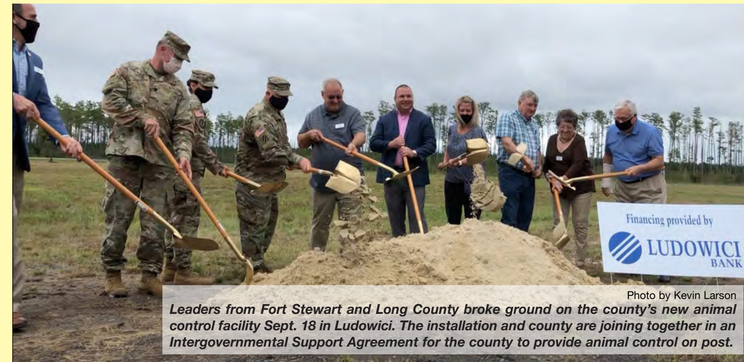
Leaders from Fort Stewart and Long County broke ground on the county's new animal control facility Sept. 18 in Ludowici. The installation and county are joining together in an Intergovernmental Support Agreement for the county to provide animal control on post.

"All of those are a way to not only look at cost savings for the military but we've also in draft legislation right now--in the upcoming NDAA--it's being considered as potential considerations for basing solutions," Logan said. "So stronger partnerships within the community might sway basing decision on how a unit grows, how a unit comes to a new installation for permanent stationing."