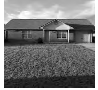
803 Waterfield Drive Hinesville - $99,900

A NICE RETREAT! Beautiful and impeccably clean 3 bedroom 2 bath home located in the C rawford Subdivision. Open floor plan. erene and beautifully landscaped backyard. Screened in pa tio, private well for irrigation, privacy fence. This lovely home f eatures a two car gar age. Conveniently located to Hwy 84, Fort Stewart Gates, Shopping and new schools in Long County. Jimmy Shanken, Coldwell Banker Holtzman, REAL -TORS, 912-368-4300 or 912-977-4733 or email jimm y.shanken@ coldwellbanker.com