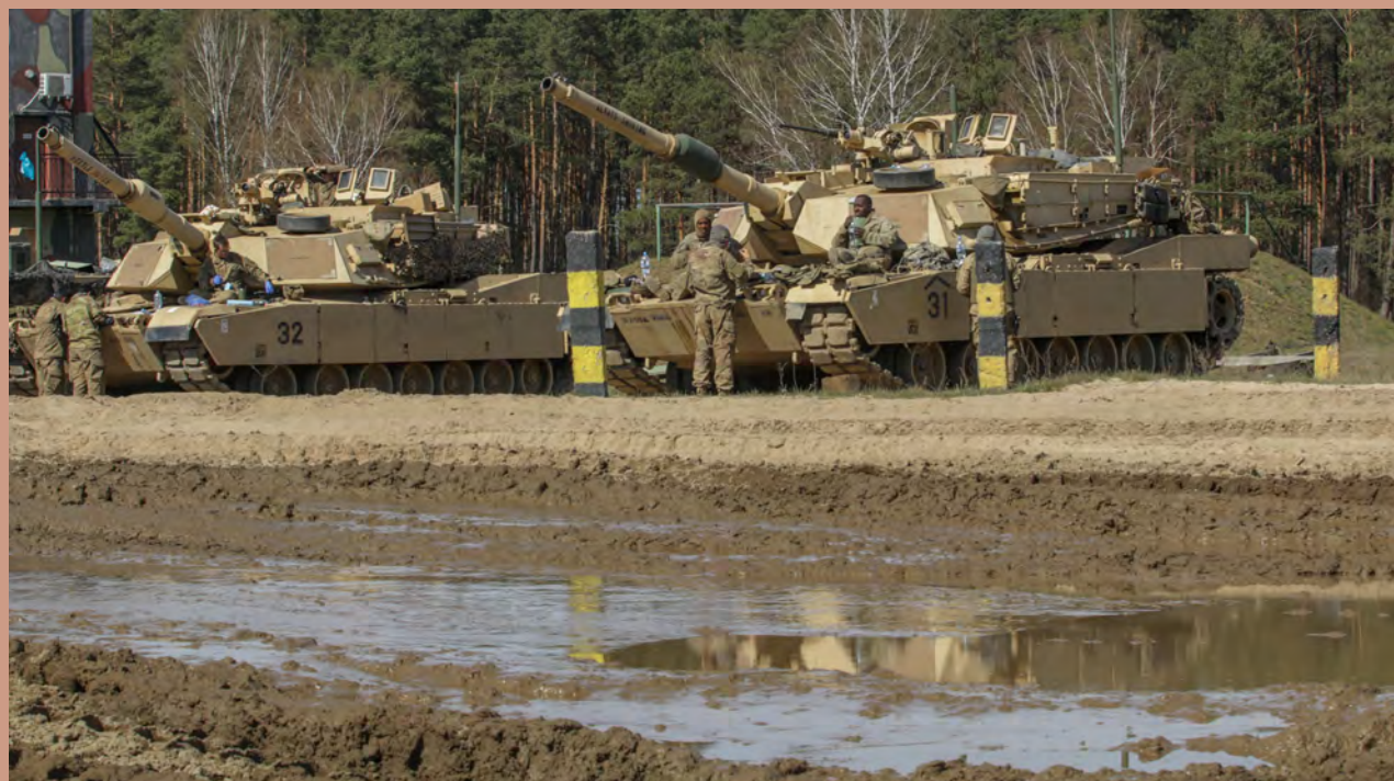
Soldiers from 2-69 AR, 2ABCT, 3rd ID, eat meals ready-to-eat and rest after conducting a table VI Gunnery iteration April 18, at Konotop range Drawsko Pomorskie Training Area, Poland.