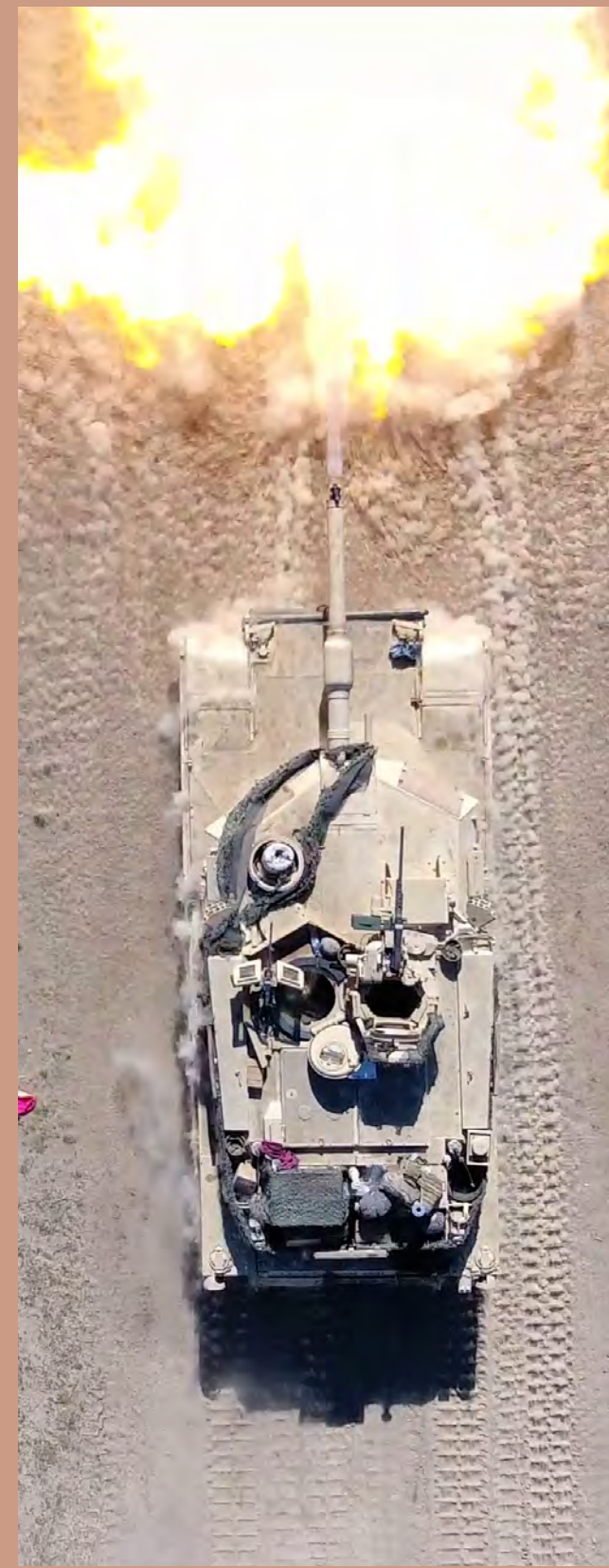
An M1 Armored crew assigned to 2nd Battalion, 69th Armored Regiment, 2ABCT, 3rd ID, engages a long-range target during a table VI Gunnery iteration April 18, at Konotop range Drawsko Pomorskie Training Area, Poland.