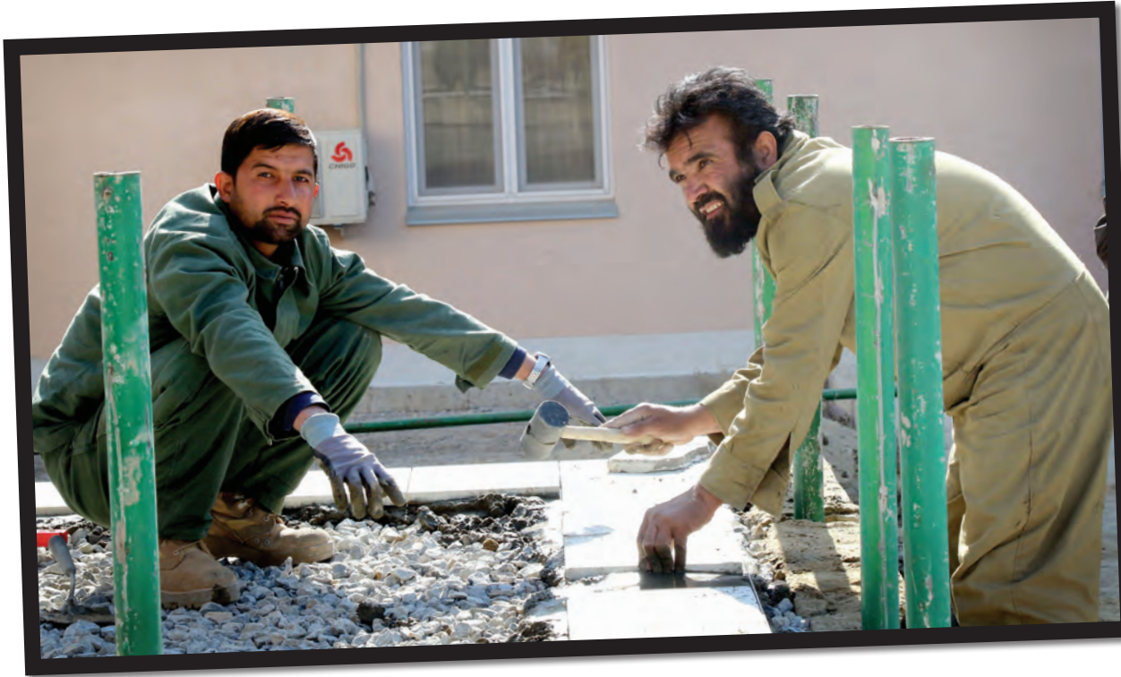
Afghan workers build a stand for their compound's flag pole at the Central Workshop in Kabul, Afghanistan Jan. 16. The Afghan National Army recently moved their workshop to this new site, where they repair weapons, vehicles and other types of equipment.