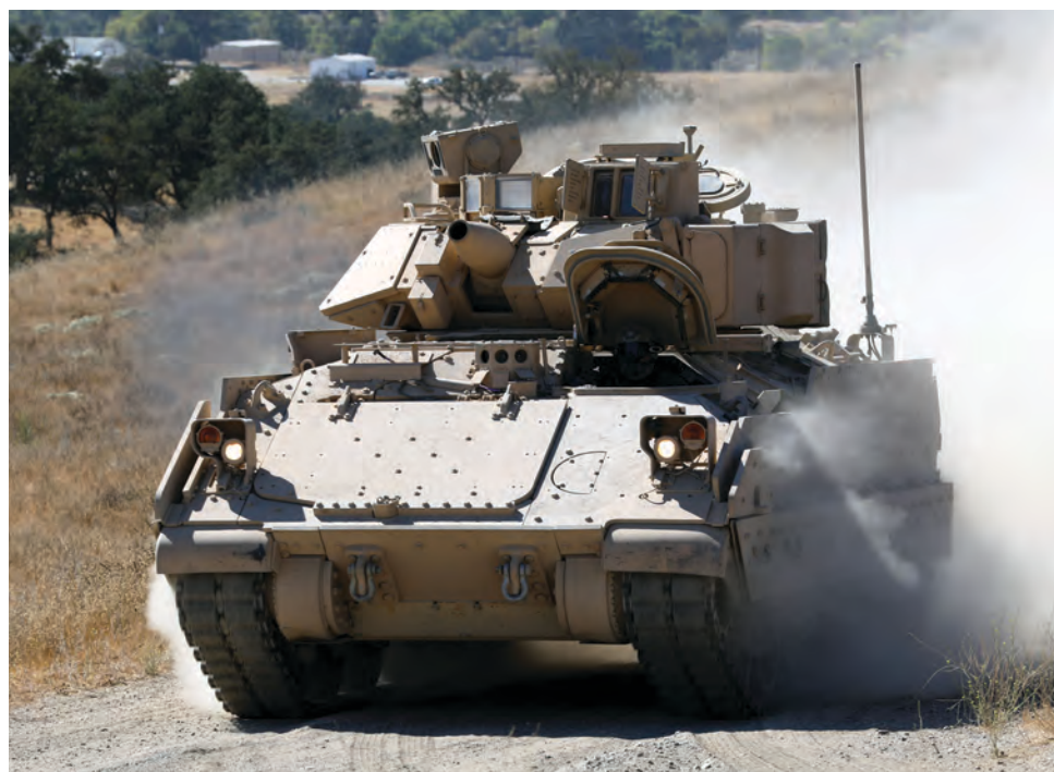
Soldiers from 1st ABCT, 2nd Bn., 7th IR, 3rd ID, participate in a Bradley Vehicle Excursion 3 test event with the IVAS prototype Capability, Sept. 4, 2021 at Camp Roberts, Calif.

A Soldier from 1st Armored Brigade Combat Team, 2nd Battalion, 7th Infantry Regiment, 3rd Infantry Division, participates in a Bradley Vehicle Excursion 3 test event with the Integrated Visual Augmentation System prototype Capability, Sept. 4, 2021 at Camp Roberts, Calif. In effort to provide situational awareness while Soldiers are in transport, a cross-enterprise Army team is working to incorporate IVAS technology and sensors into vehicle platforms for optimal battlefield visibility at every stage of the mission.